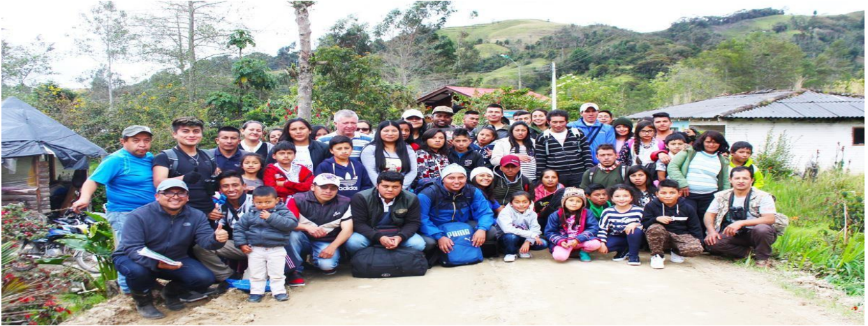
Foto: Participantes del Festival Comunitario de Aves.

El Motilón Path, El Encano Village, Pasto. December 2018. The seventh edition of the "Laguna de la Cocha Ramsar wetland bird community festival" was held, a natural and cultural conservation strategy led by the ADC Peasant Development Association and the Asoyarcocha Minga in favor of birds, children, biodiversity and culture.