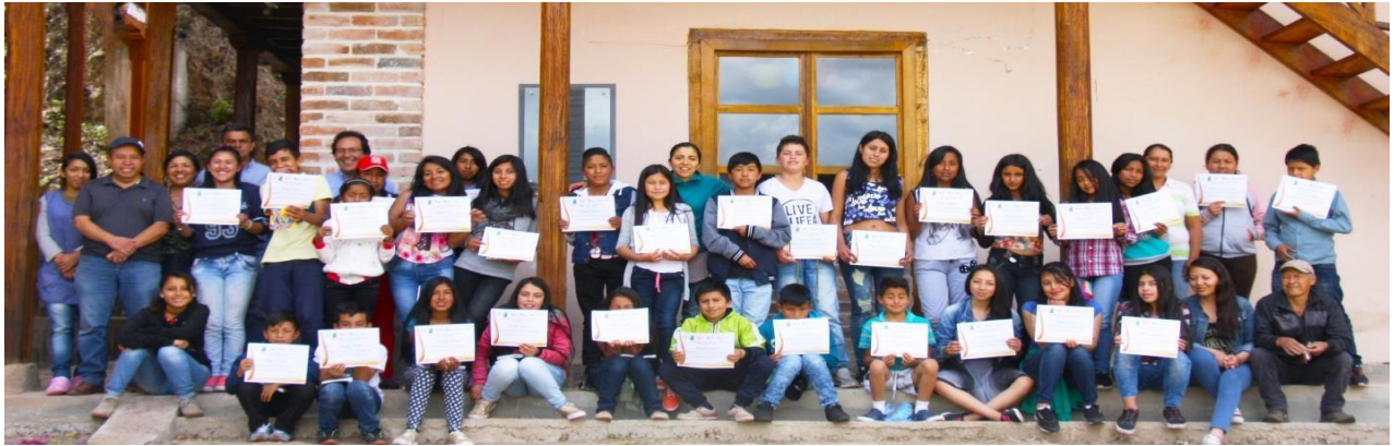
Photo: Group of Heirs of the Planet that finished the cycle of formation. ADC Communications