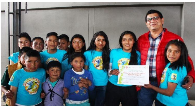
Promotional Poster. ADC Communications

https://www.youtube.com/watch?v=6M2W1RWui3E&t=7s&fbclid=IwAR0hxv0eW4WvGZ_PZDJ2zXQnx17yTfVgmy-ajTNq9xTTPXzoQyrjuvYkQJC0