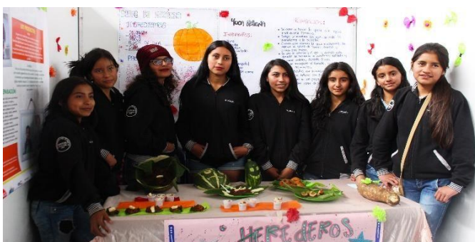
Photo: Group of Heirs of the Planet Friends of El Pailón. ADC Communications